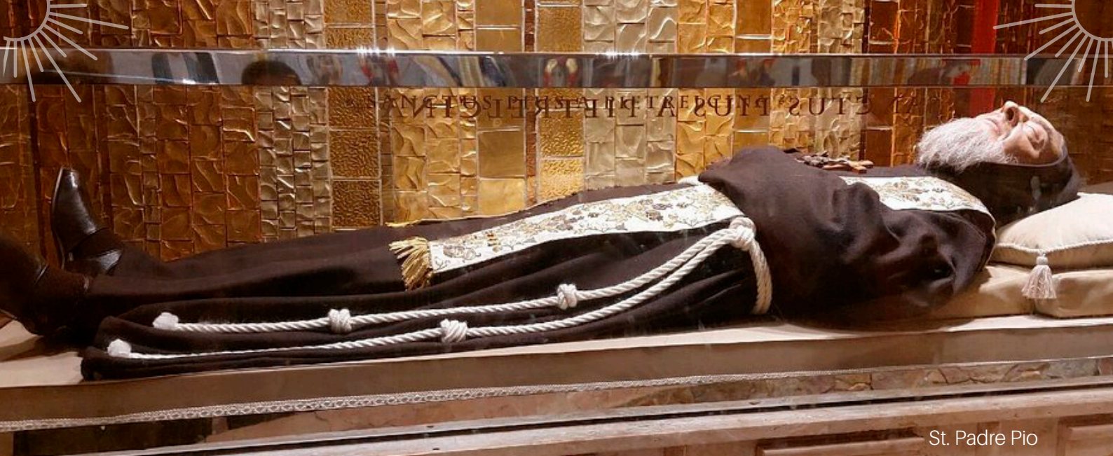
St. Padre Pio